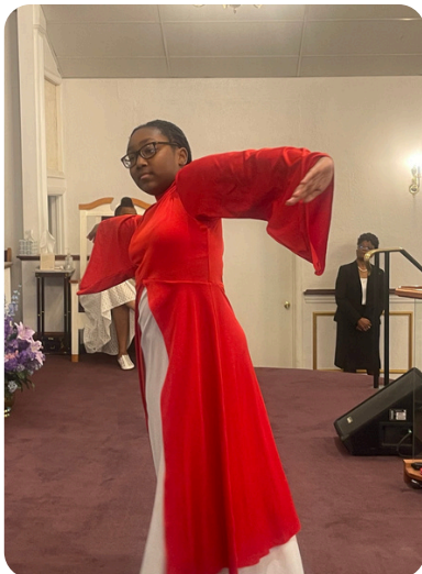
"WE" Praise Dancers of the SBC on Resurrection Sunday blessed us mightily!