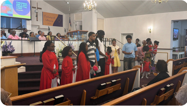
SBC Children & Youth reading & reciting the ABC Scriptures for Resurrection Sunday