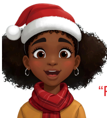
"Frosty the Snowman"