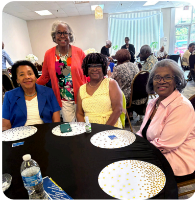
SBC Senior Trailblazers at Tuckahoe Association Men's Division Pre- Father's Day Luncheon